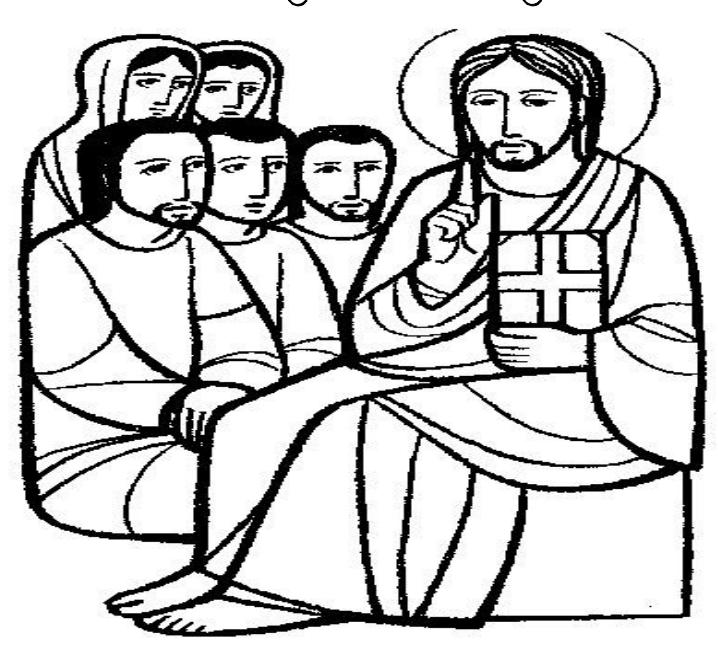
God's Spirit in the World

Jesus said to his disciples: 'Anyone who is not against us is for us'. One of the temptations for us as human beings is to try to control everything. We do it in the close relationships of marriage and family life. And we do it in the context of our life of faith with one another in the parish and in the Church generally. And when we try to exercise control in these areas we set limits to the wonderful possibilities that are there for us. The greatest effort of faith is always to give control back to God and live the ways God wants us to live. This has huge implications for marriage and family life in that God's way is one of love and affection; of joy and gladness; of peace and forgiveness. It also has very big implications for our faith community, which is called to grow in such a way that there is room for everyone.